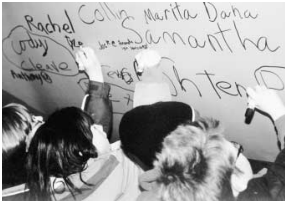
Athol Elementary School students signing the LSV-2 before the christening ceremony.