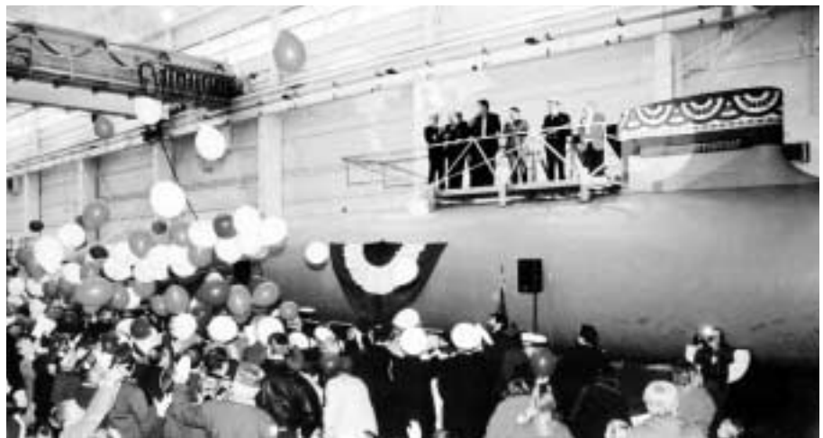
Immediately following the christening, 1200 balloons were released.